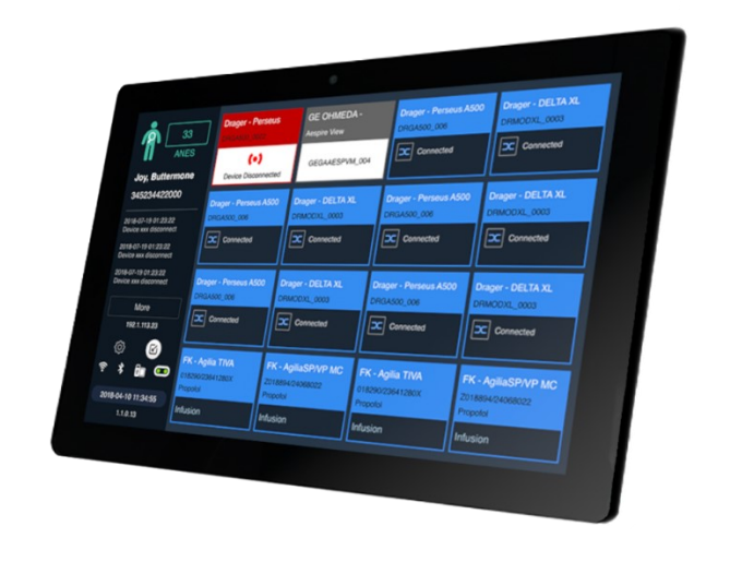
KRYON Max UI

The intuitive operation interface is convenient for medical personnel to use and keep track of the connection status of the patient's equipment. It can also integrate the patient's clinical statistical data through the IoT server and upload it to various data application systems.