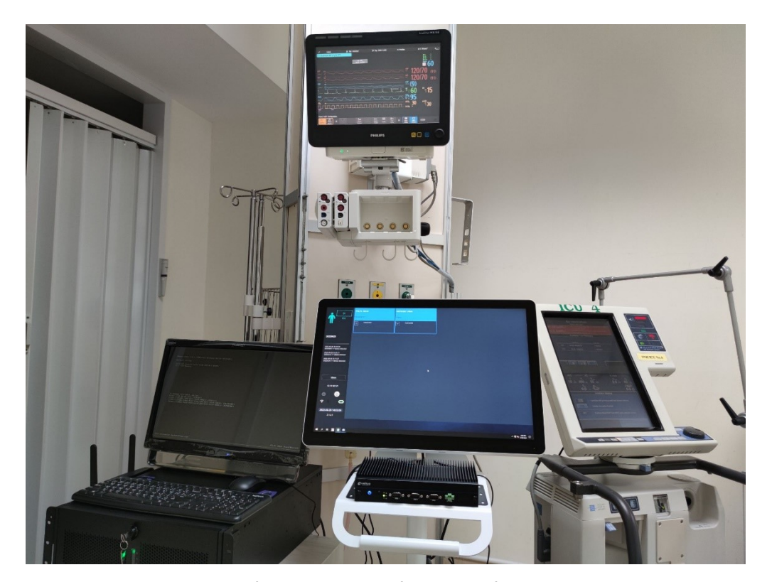
Total KRYON ICU solution in the ICU