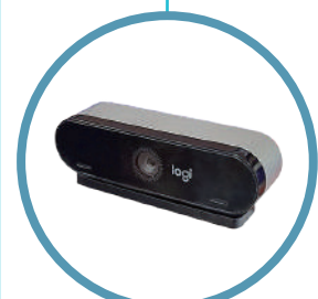
4K HD Camera