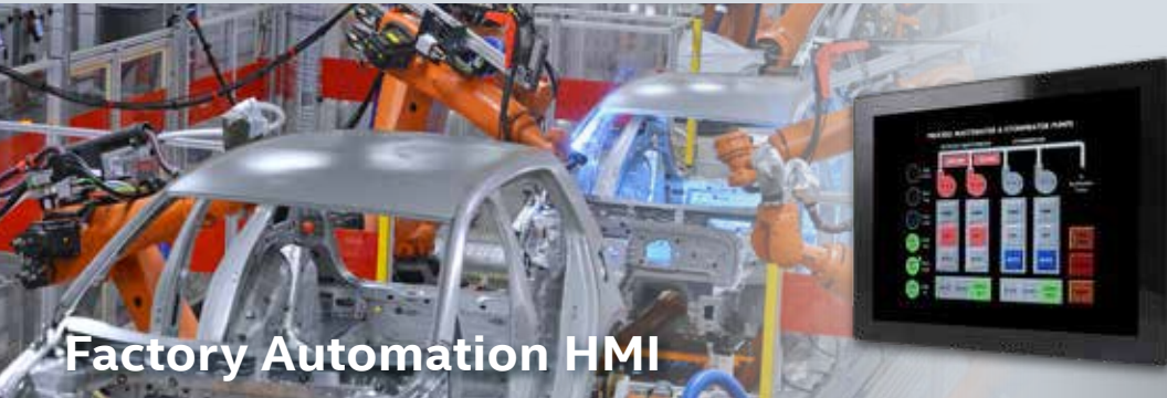
Factory Automation HMI